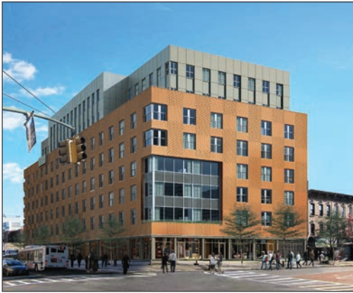
The Clark at the corner of Clarkson & Nostrand